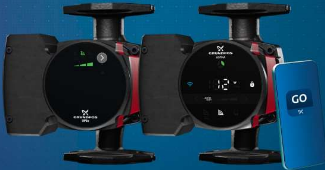
THE NEW UPSe