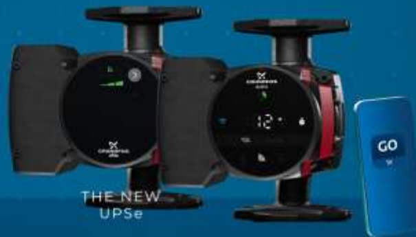
THE NEW UPSe

ARE YOU READY FOR THE NEXT STEP IN CIRCULATOR PUMPS?